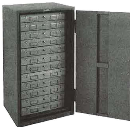
MODEL 401 with 12 Cornell drawers

Dimensions Height 42 3/4" Width 23 3/16" Depth 20 1/32"